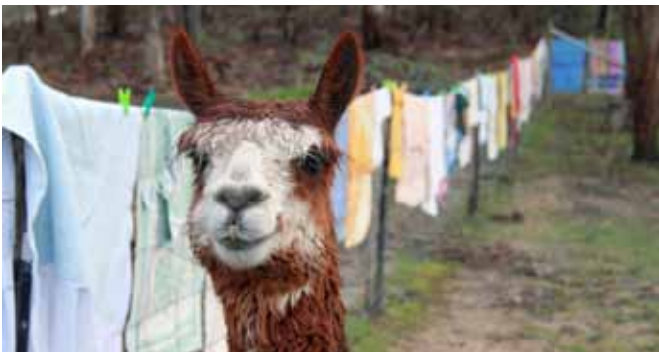
Tobago the Alpaca helps out with the laundry.

There's a huge variety of indoor/outdoor, administration & outreach jobs: washing & drying laundry, feeding, preparing milk bottles for orphans, sweeping & cleaning floors, cleaning enclosures & cages, rescuing injured & orphaned animals, collecting & distributing donation tins, fund raising activities, promotions & stalls, small building projects, gardening and property maintenance.